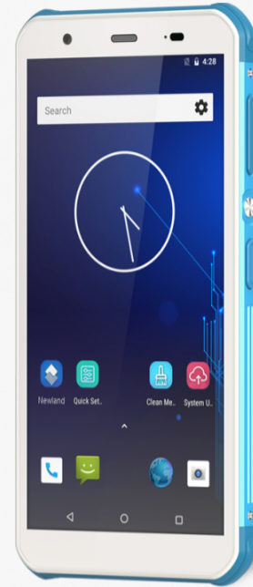
M10 Mobile Computers